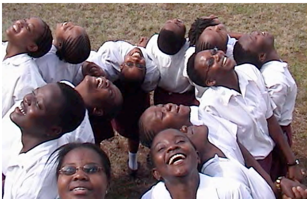
THEY DECIDED TO SEND YOU THEIR BEAUTIFUL SMILES!