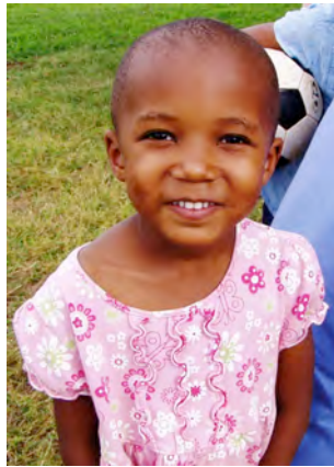
SIX MONTHS LATER, PRETTY IN PINK