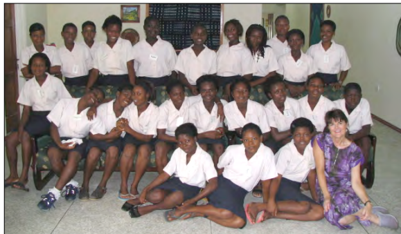
ALL TWENTY-FOUR GIRLS OF THE RAFIKI GIRLS CENTER.

Greetings from Ghana! Words are hard to find that adequately express the gratitude I have for your partnership. Thank you for your prayers, donations, cards, and emails! I sincerely appreciate you! The entire Rafiki Village greets you! Above is a picture of the people of the Rafiki Village Ghana at the entrance to the Village, taken December 2004. I teach the girls in the navy skirts and white shirts on the left. We now have twenty-four girls (pictured below). The girls do not live at the Rafiki Village; they travel from neighboring villages for day classes, (8 A.M. – 4 P.M.). The other children are the orphans that live on site. We now have fifty-five orphans, six national Rafiki Mothers ("mammias"), and six national Mother's Assistants ("aunties").