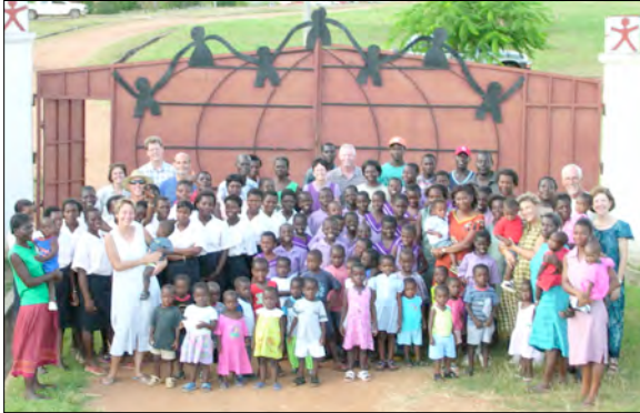
THE PEOPLE OF RAFIKI VILLAGE GHANA

Greetings from Ghana! Words are hard to find that adequately express the gratitude I have for your partnership. Thank you for your prayers, donations, cards, and emails! I sincerely appreciate you! The entire Rafiki Village greets you! Above is a picture of the people of the Rafiki Village Ghana at the entrance to the Village, taken December 2004. I teach the girls in the navy skirts and white shirts on the left. We now have twenty-four girls (pictured below). The girls do not live at the Rafiki Village; they travel from neighboring villages for day classes, (8 A.M. – 4 P.M.). The other children are the orphans that live on site. We now have fifty-five orphans, six national Rafiki Mothers ("mammias"), and six national Mother's Assistants ("aunties").