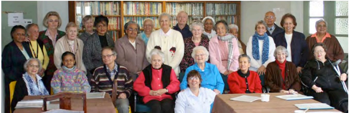
RAFIKI PRAYER GROUP IN CAPE TOWN—TAKEN AFTER MOM'S MEMORIAL SERVICE

"I will praise you, O LORD, with all my heart; I will tell of all your wonders. I will be glad and rejoice in you; I will sing praise to your name, O Most High" (Psalm 9:1-2 NIV).