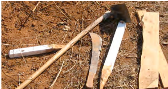
SOME OF THE AFRICAN TOOLS USED AT THE BUILDING SITE

Things continue to move forward as the trenches are dug and ground is prepared for the foundations of the first of the buildings that are to be constructed in our Village. During the first phase, we will build three ROS houses, six children's cottages, a guest house, dining hall, kitchen, and laundry.