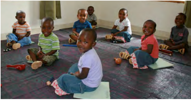
THE CHILDREN LOVE MUSIC TIME AT SCHOOL