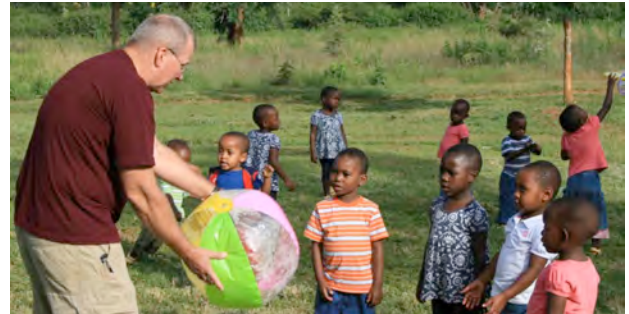
WHO KNEW THAT A BEACH BALL IN THE MIDDLE OF AFRICA COULD BE SO MUCH FUN?