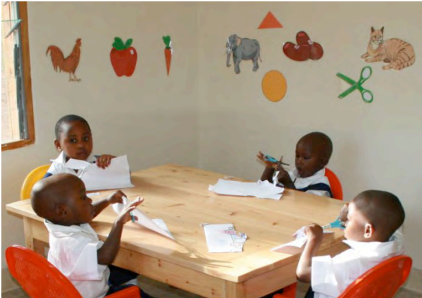
USING A PAIR OF SCISSORS LOOKS EASIER THAN IT IS

Everything is new to our children. Many things that one might take for granted that a child would have seen or done are totally new adventures for our Rafiki children. From playing with Play-Doh or Legos to learning to use a pair of scissors or gluing a piece of paper, it's all fun and exciting and NEW, and the children love it.