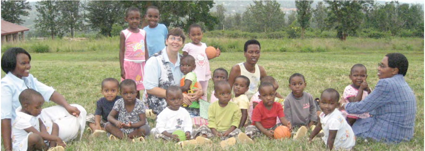
OUR FAMILY OF SIXTEEN CHILDREN AND THREE RAFIKI MOTHERS

"It is good to praise the LORD and make music to your name, O Most High, to proclaim your love in the morning and your faithfulness at night" (Psalm 92:1-2).