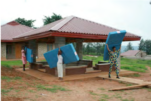
RAFIKI MOTHERS HELP TO GET THE COTTAGES READY FOR THE CHILDREN

The first three children's cottages are complete and ready for the children to arrive. The Rafiki Mothers were excited to be able to help me get the mattresses into the cottages and onto the beds. Now we just need children to sleep in those beds. Toys, books, clothes, bedding—everything is ready!