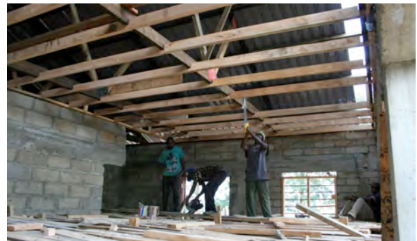
WORK BEING DONE ON THE CEILING OF THE RAFIKI KITCHEN

Construction on the dining hall continues. We are grateful that we have not had any accidents even though the men stand on “make-shift” scaffolding to work on the ceiling.