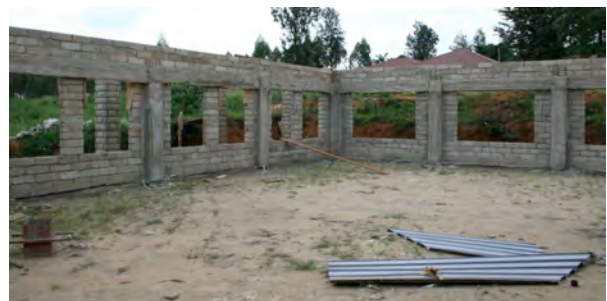
WE DO NOT HAVE ROOFING SHEETS UP OVER THE DINING HALL PORTION YET; THAT WILL COME NEXT.

Construction on the dining hall continues. We are grateful that we have not had any accidents even though the men stand on “make-shift” scaffolding to work on the ceiling.