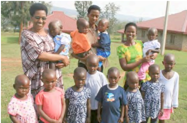
OUR FIRST TWELVE CHILDREN

Our teammates brought the first six children to our Village on January 21st and six more on the 22nd. It was such a wonderful blessing to return to three cottages teeming with twelve little voices. After just a week the three families, two cottages of four girls and one cottage with four boys, were settling in, bonding and adjusting.