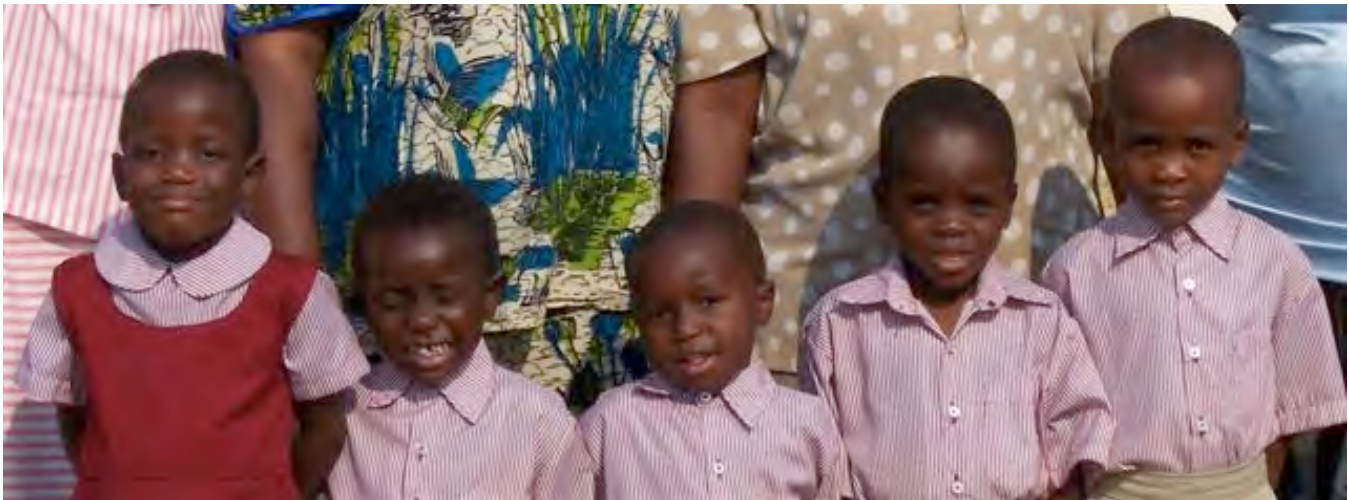
FIRST CHILDREN AT RAFIKI VILLAGE ZAMBIA AS THEY COMPLETE THEIR FIRST WEEK OF SCHOOL

“Behold, I am doing a new thing; now it springs forth, do you not perceive it?” (Isaiah 43:19).