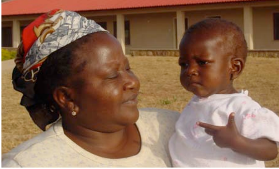
...AND "HELLO" AT RAFIKI

We will be in the U.S.A. from May 28–August 4, visiting and sharing in the areas below. Drop us a line if you need more details. We would love to see you!