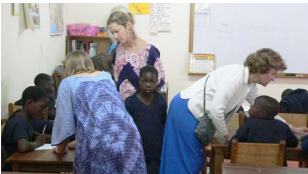
MINI MISSIONARIES HELPING IN THE CLASSROOM

Teachers arrive at 7:30 every morning. Then it is off to the classroom to be sure that everything is in order before returning to the staff room for prayer. The prayers offered reflect the heart desire of our teachers for the students to be successful and well behaved and that we, as teachers, will reflect the love of Christ to them.