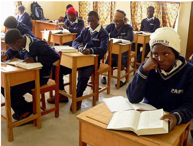
JUNIOR SECONDARY STUDENTS