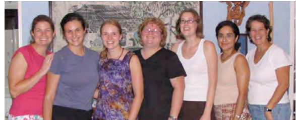
DINNER PARTY WITH MINIMISSIONARIES

Speaking of visitors!!! Wow!!! We had so many MiniMissionaries come to help. I think it was the most I have seen in such a short period of time. It was so wonderful to have the help at the girls' center. In addition, I truly enjoyed their company and comradeship. I have attached a picture of them when they were in my house for dinner. I have recently heard that one of them is now pursuing becoming an ROS (Rafiki Overseas Staff)!