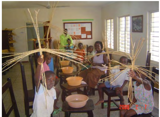
BASKET WEAVING CLASS ON SATURDAY MORNING

The Rafiki School Children's Choir invited our neighboring village (an orphanage) to their first official performance. Our choir received a standing ovation and willingly gave an encore! Our choir now wants to go on a "road tour."