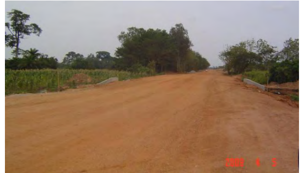
THE WIDE REBUILT RAFIKI ROAD

Our Rafiki Village continues to study the Old Testament Israelites in the Book of Judges as they claim and live in the Promised Land. They saw "There is wideness in God's mercy." We are grateful to see God's wide mercy every day at Rafiki Village Ghana.